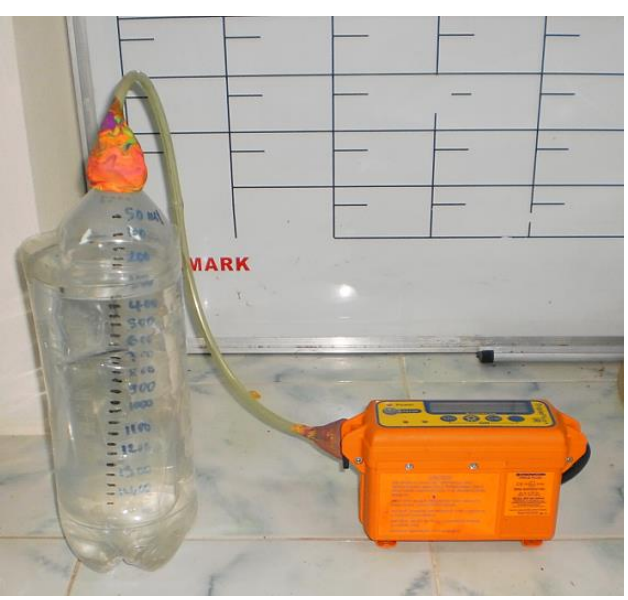
2. %, CH4 measured by Crowcon infrared analyser