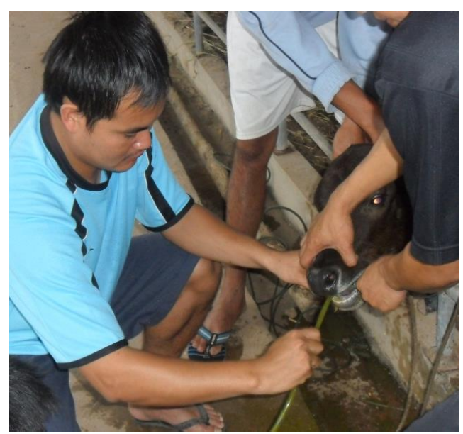
Taking the rumen fluid by stomach tube