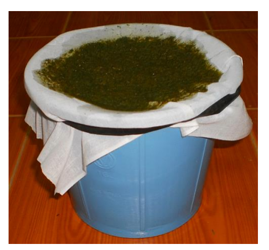
3. Each water bottle filtered by white cloth (particle sizes to at least 0.1mm)and dried (100c for 24hours) in oven for finding DM substrate fermented